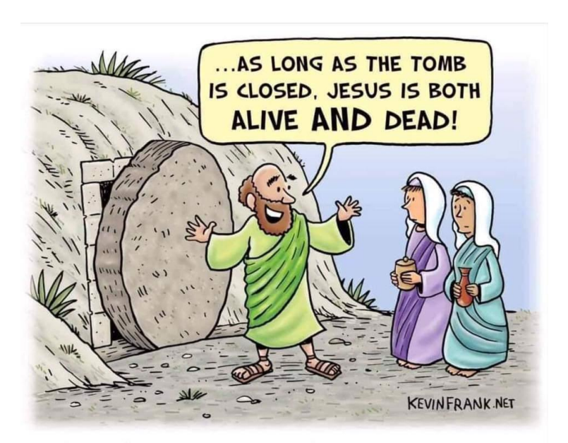
Saint Schrodinger, the forgotten disciple.