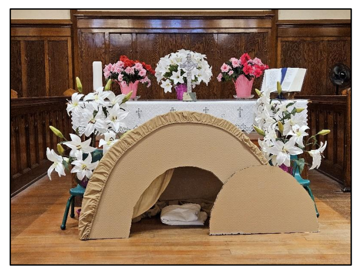
The Tomb was Empty! (Yes, we checked!)