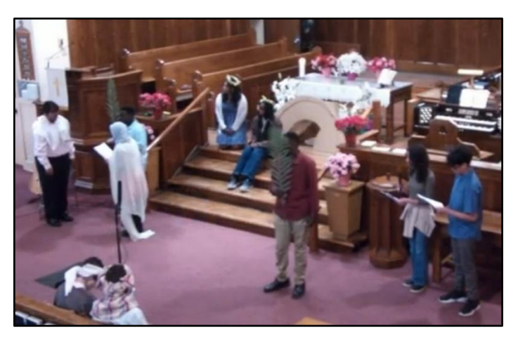
Youth Group Easter Sunday Skit: The Rock that Rolled