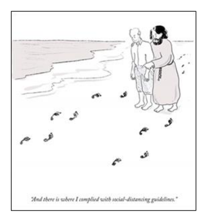
"And there is where I complied with social-distancing guidelines."