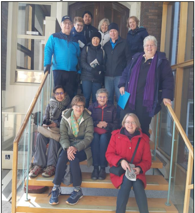
A dozen church members showed up to walk and pray for the people in our neighbourhood, and others joined in prayer from home. We

We began with a Thanksgiving Prayer Walk around the neighbourhood on October 12th.